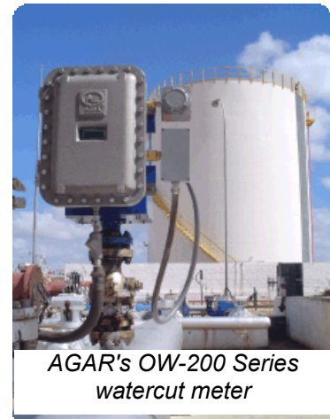
AGAR's OW-200 Series watercut meter