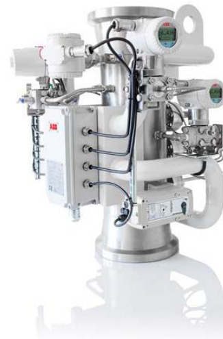
ABB's Vega Isokinetic Sampling (VIS) multiphase flowmeter

Norway has been a primary source of multiphase flowmeter research and development.