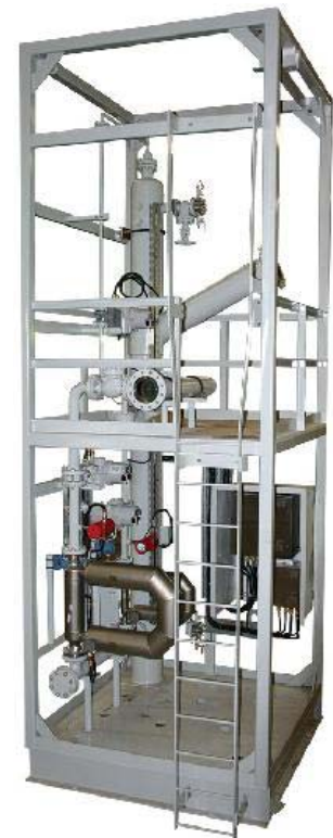
Weatherford's VSRD Multiphase Meter

Complicating matters is the fact that the acquisition of data to make intelligent assessments of well performance has often been difficult, while secondary recovery methods are costly. Multiphase flowmeters are designed to provide this data in real time, but have traditionally not been reliable enough to fulfill their role as sole data source.