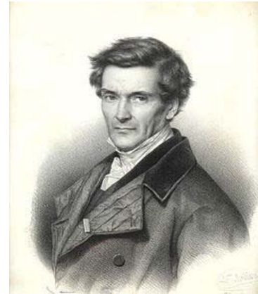
Gaspard-Gustave de Coriolis

Flow Research, Inc. 27 Water Street Wakefield, MA 01880 United States [1] 781 245-3200 [1] 781 224-7552 (fax) www.flowresearch.com