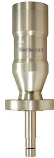
Weatherford's Red Eye subsea watercut meter

This study will also include data and important discussion of the following subjects: