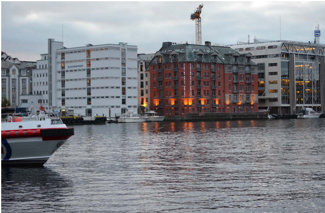
Bergen, Norway

www.FlowMultiphase.com www.WatercutMeters.com