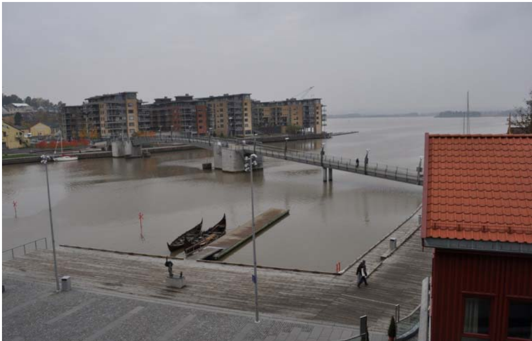
Tønsberg, Norway, venue of North Sea Flow Measurement Workshop